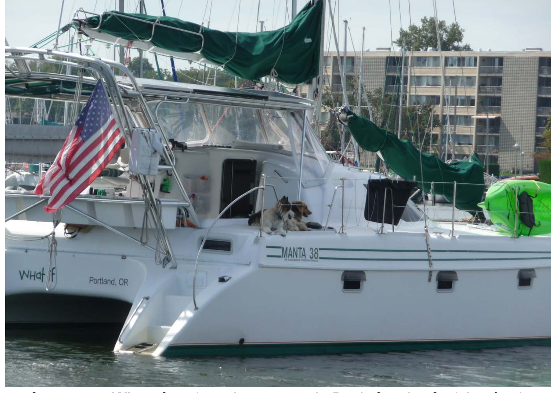
Catamaran What If anchored next to us in Back Creek. Cruising family from Oregon with 2 dogs onboard.