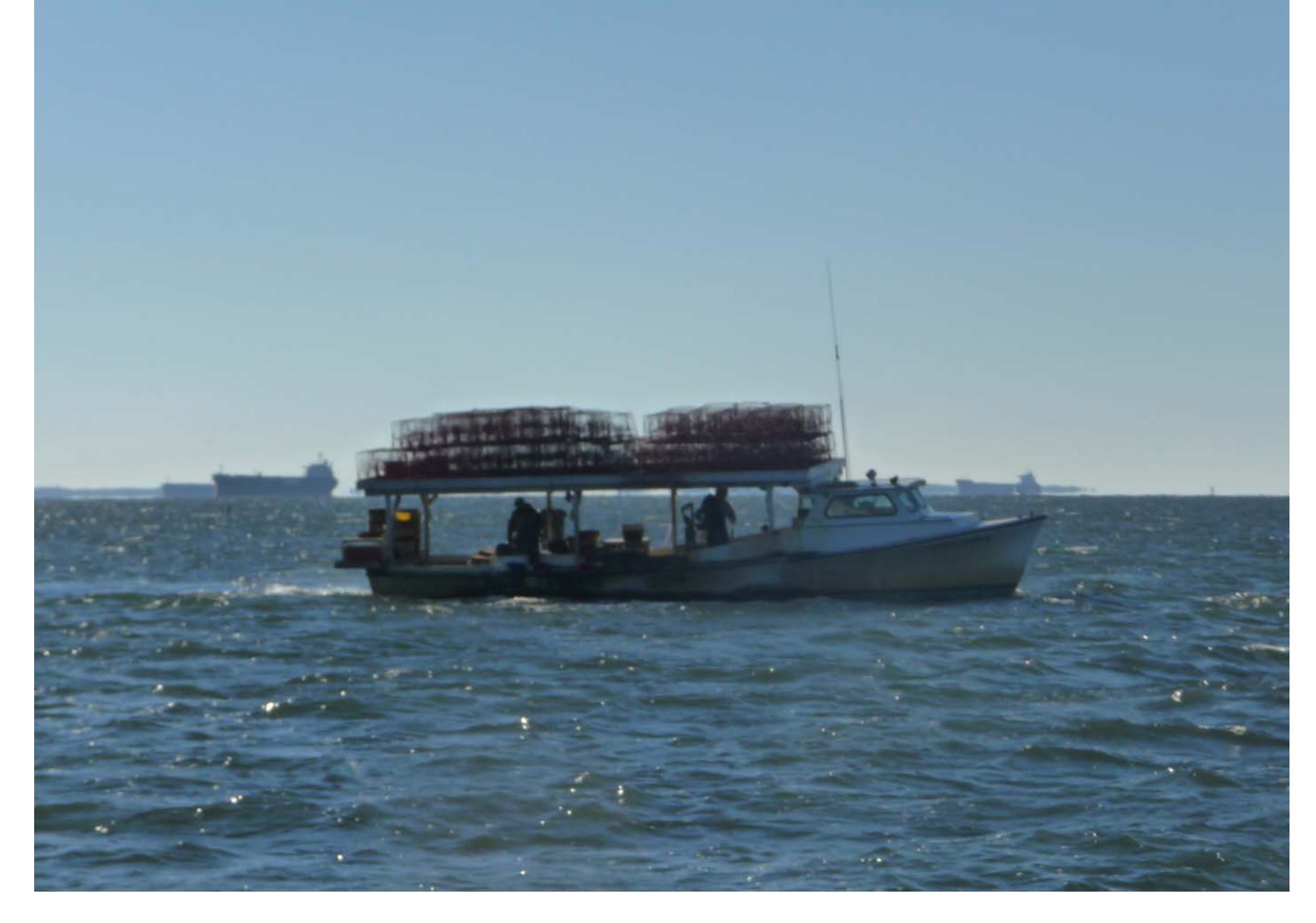
We see this loaded crab boat as we leave Annapolis on Oct. 11.