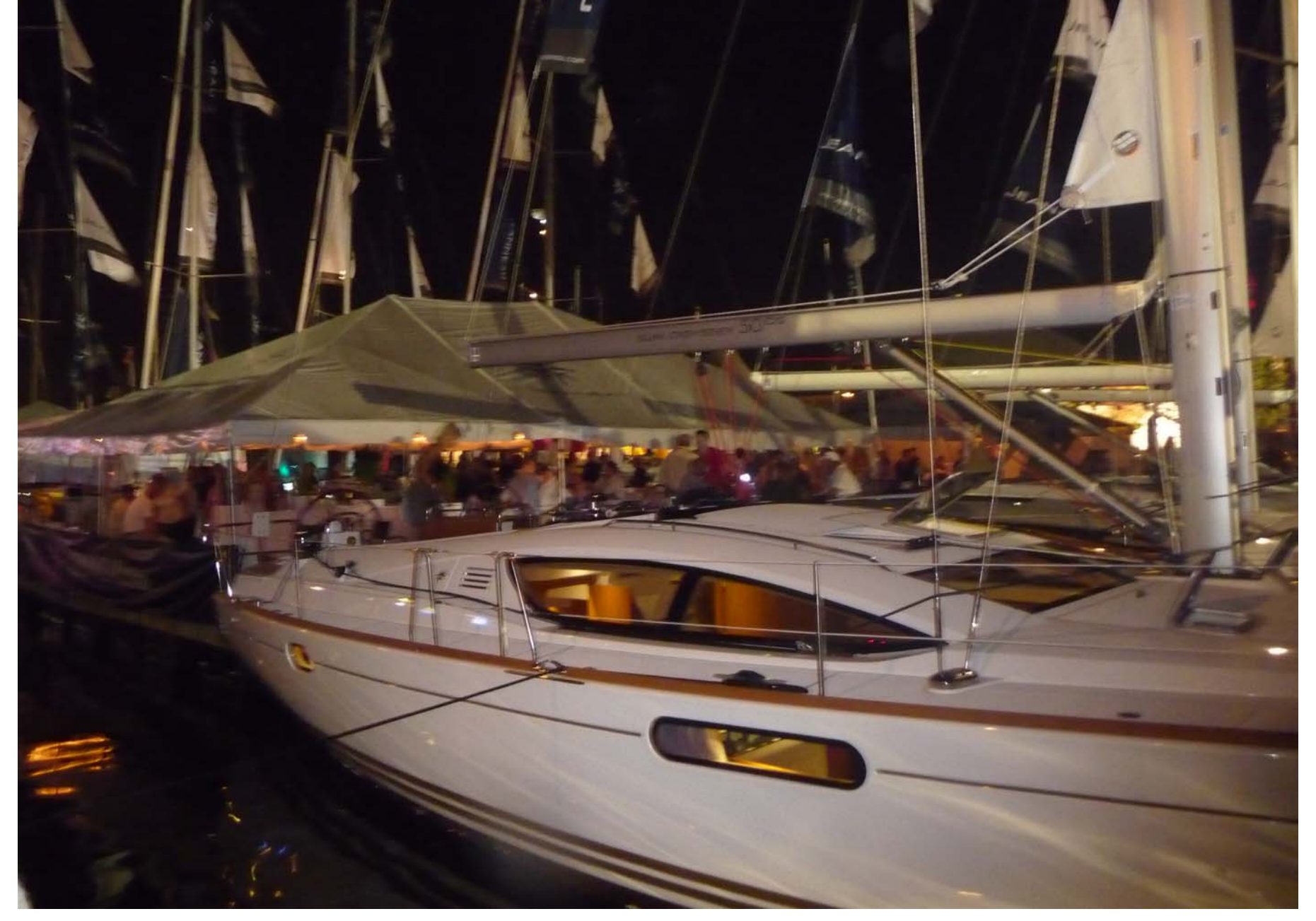
Another cocktail party the Friday night of the Boat Show.