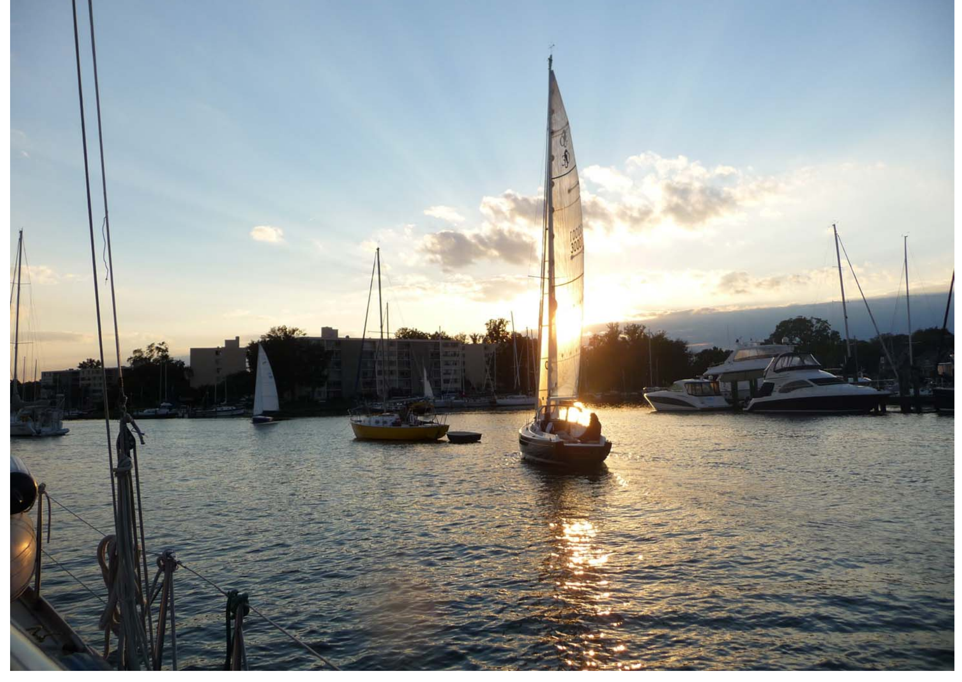
The Sparkman Steven's 30 sails into the sunset in Back Creek.