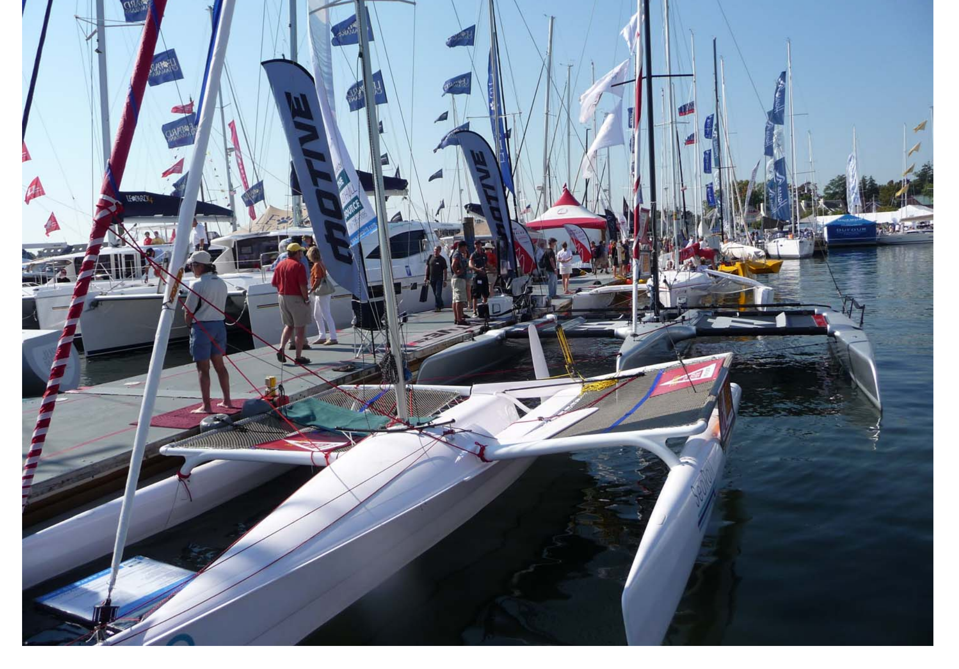
Some "go fast" trimarans.