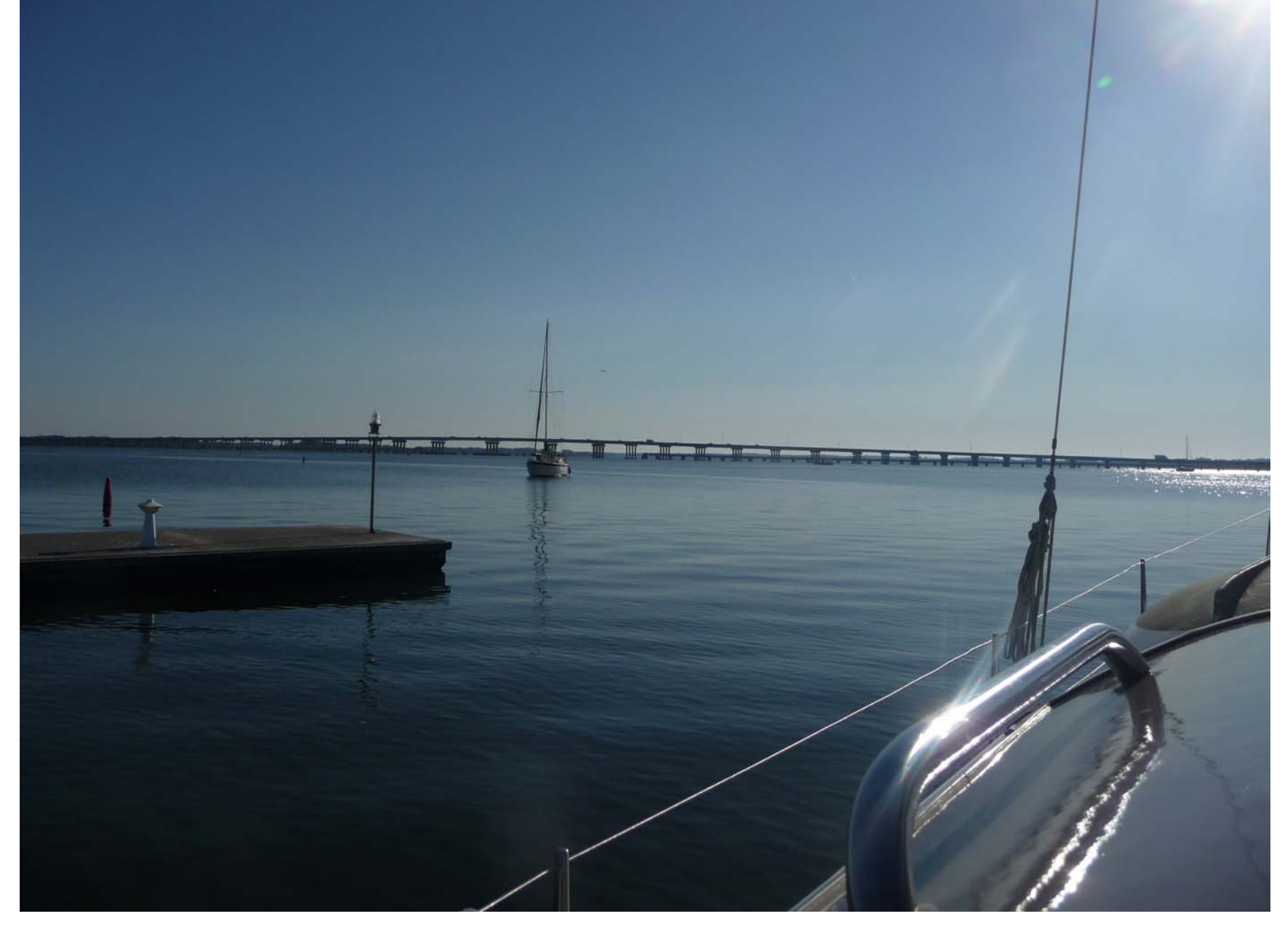
Very peaceful waters. It picked up in a short time with strong NW winds and we anchored in a pretty creek up the Choptank River.