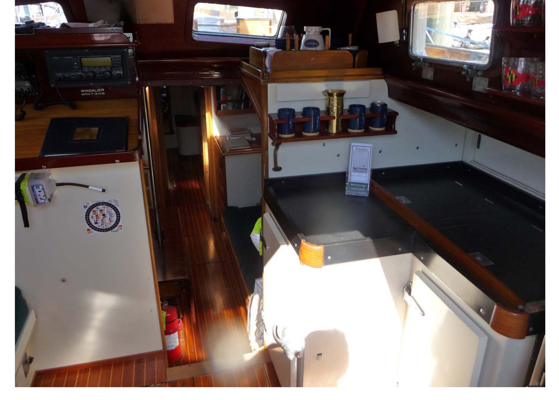
Interior of the Windalier.