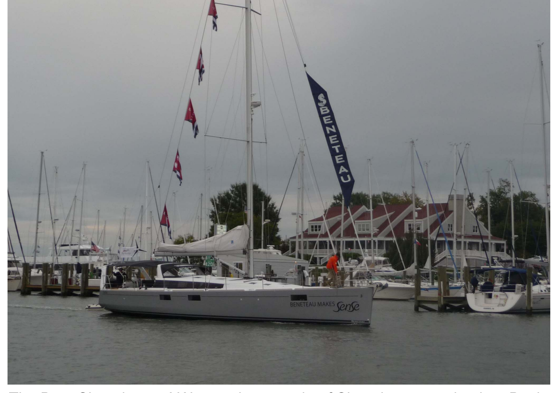
The Boat Show is over! We watch a parade of Show boats coming into Back Creek to dock at their brokerages.