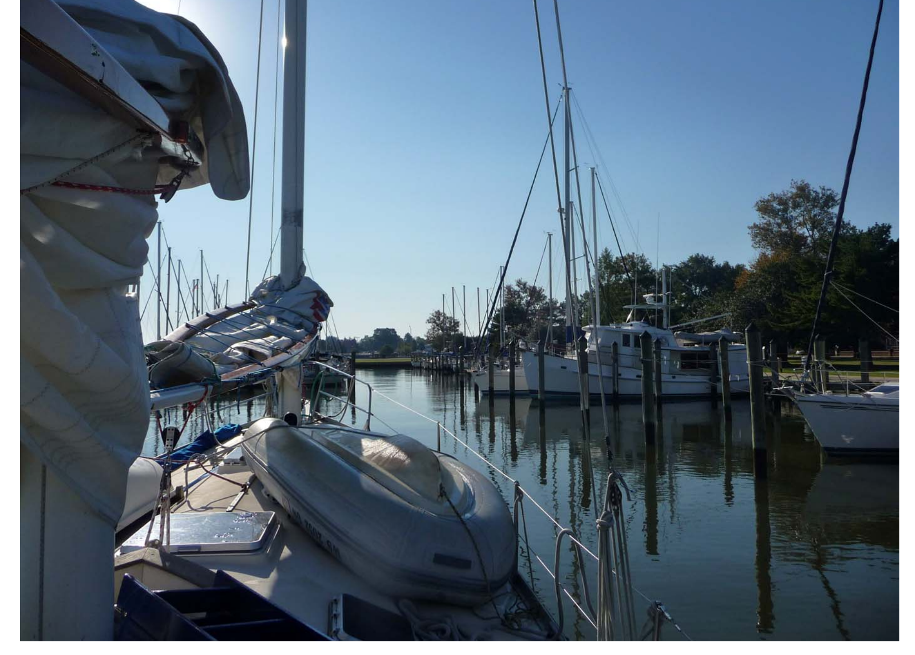
Early morning as we leave Cambridge, MD, Oct. 12.