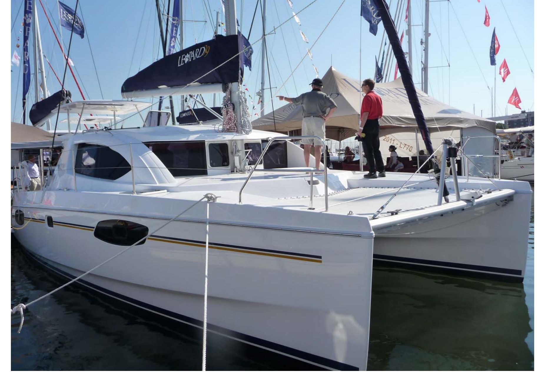
One of the Leopard catamarans.