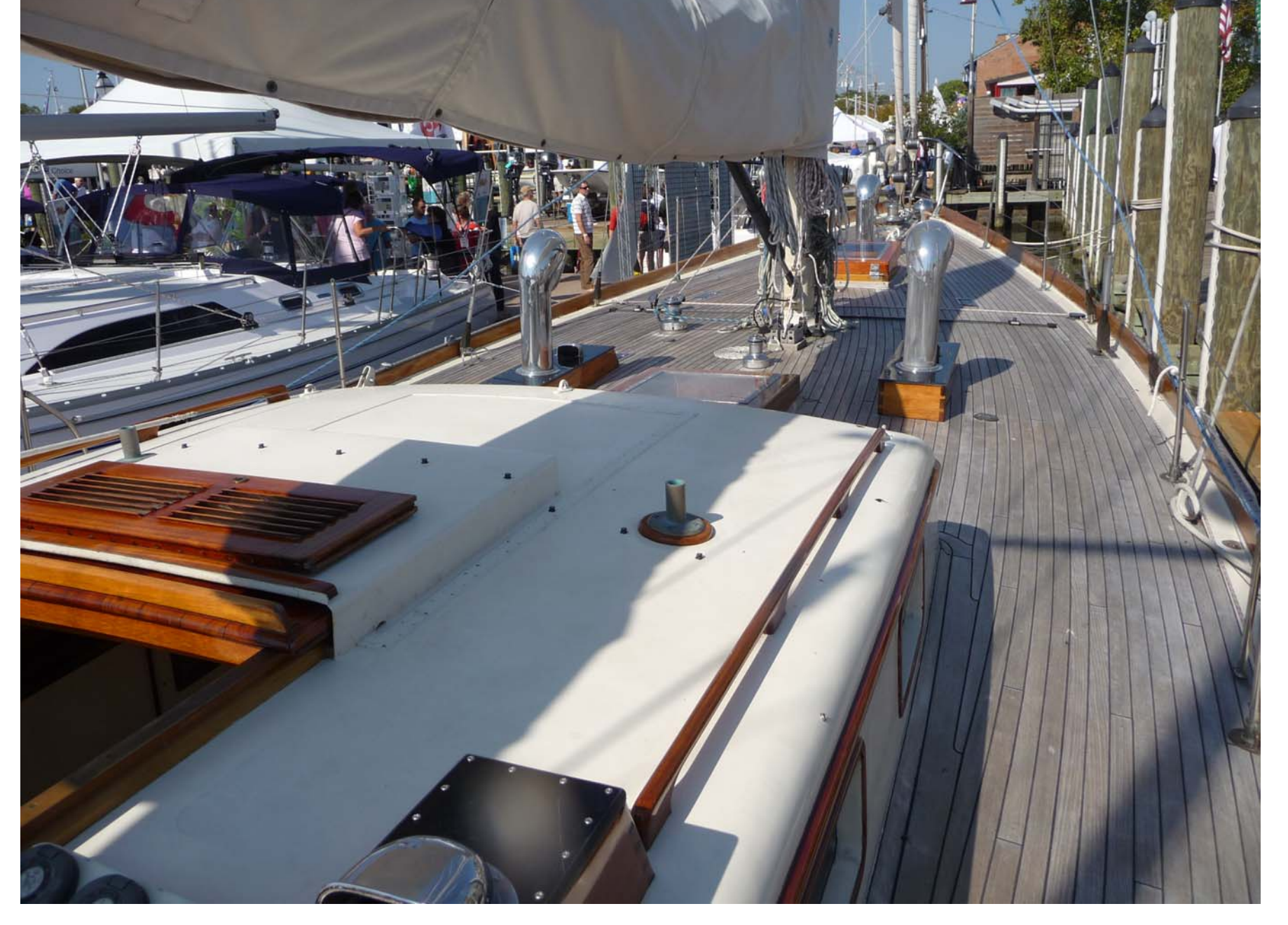
The Windalier, an old Sparkman & Steven's sloop.