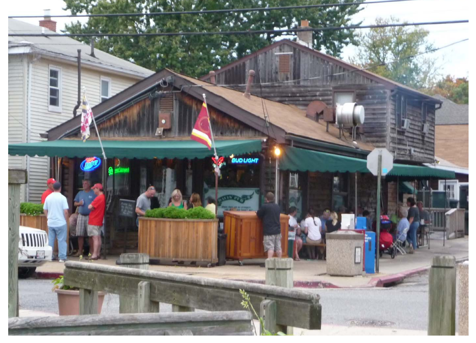
Davis' Pub near the dinghy dock in Eastport. Great neighborhood bar.