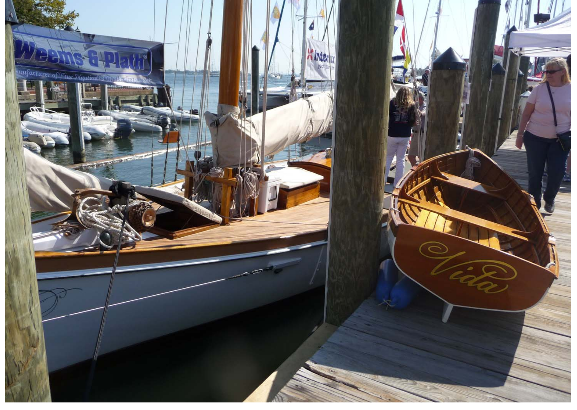
The Chesapeake Maritime Museum's Elf and it's dinghy Vida.