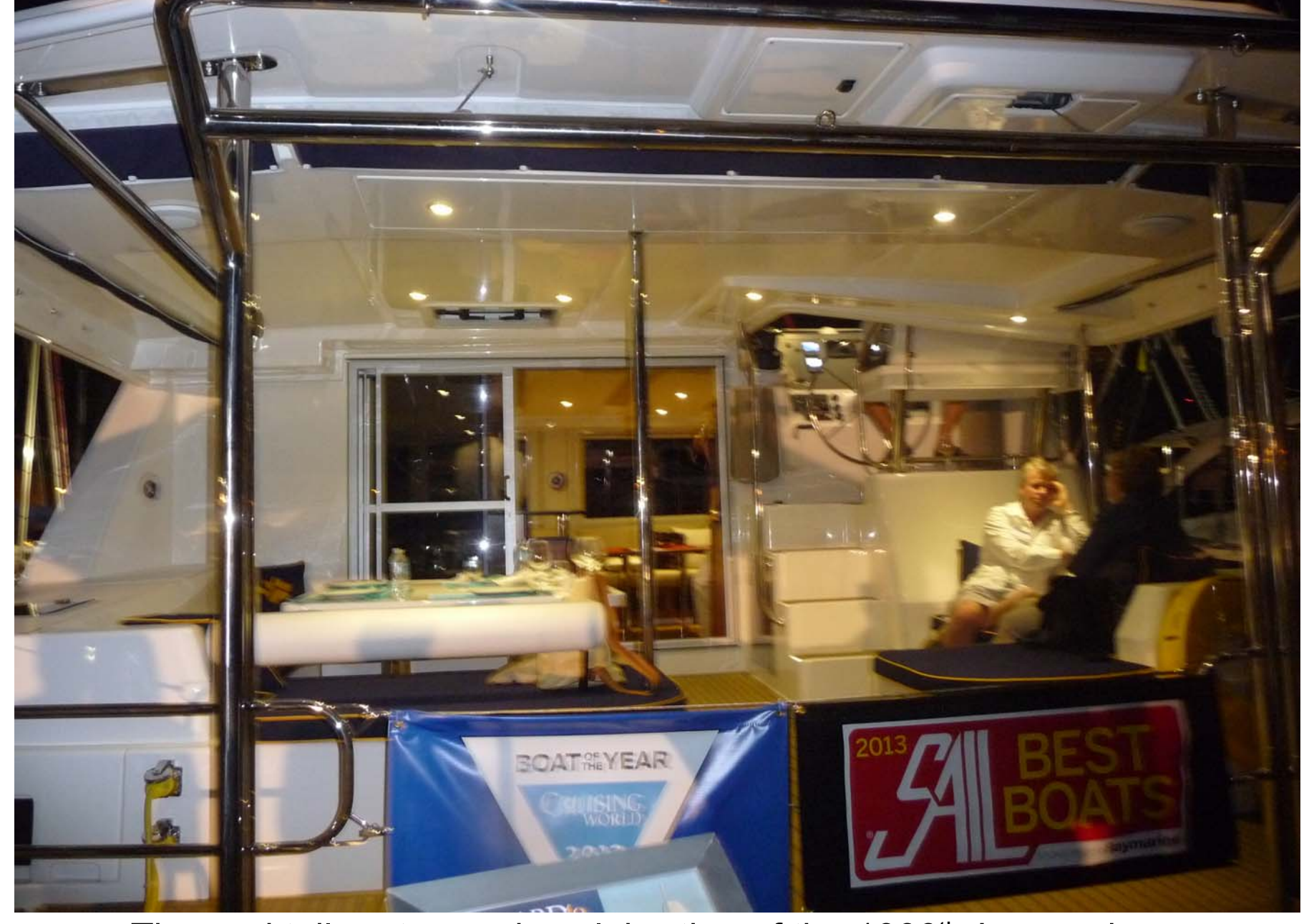
The cocktail party was in celebration of the 1000<sup>th</sup> Leopard Catamaran sold.