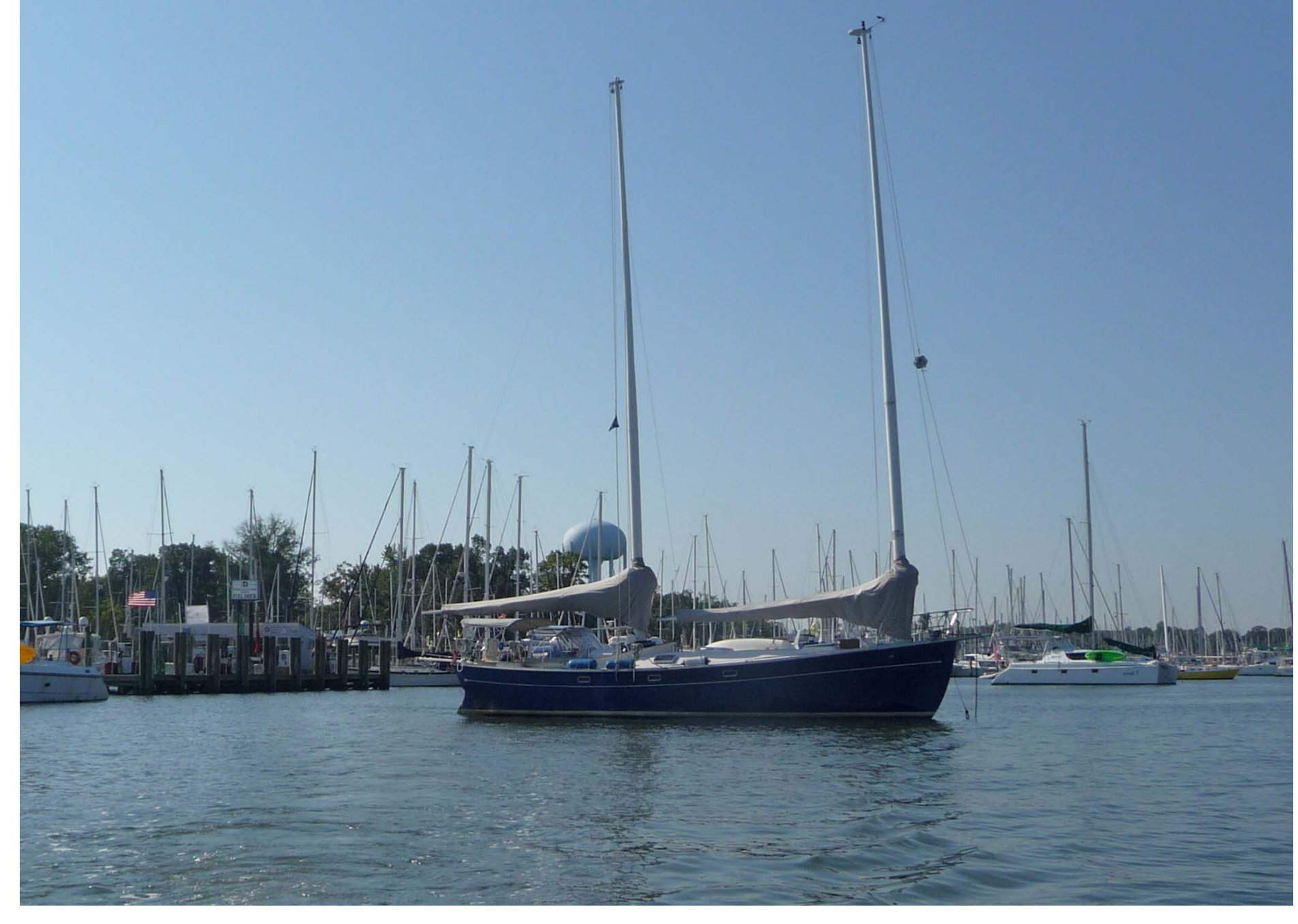
Running Free anchored in Back Creek for the Boat Show.