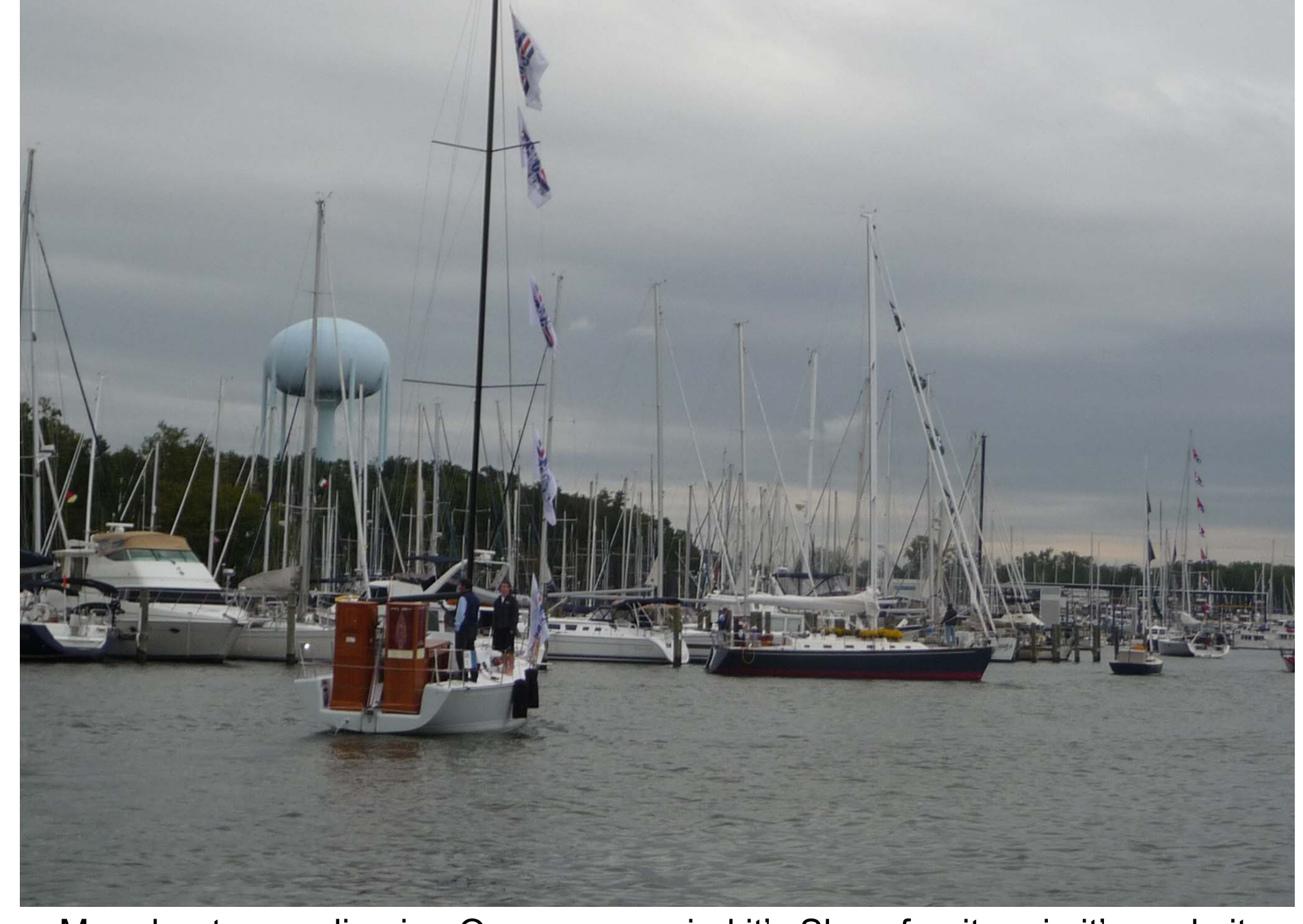
More boats parading in. One even carried it's Show furniture in it's cockpit.