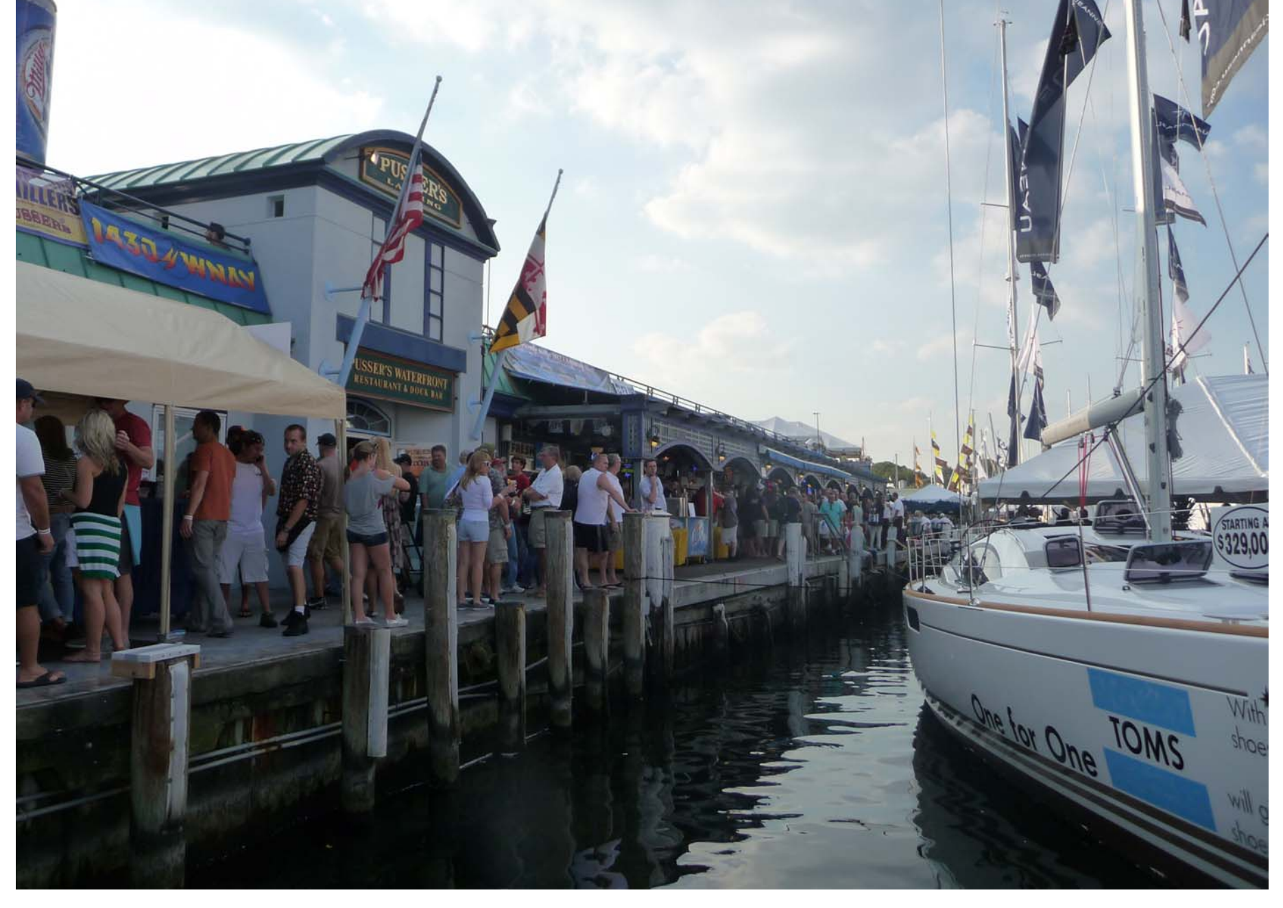
Wonder how many of these Pusser drinkers fell into the water at the Show?