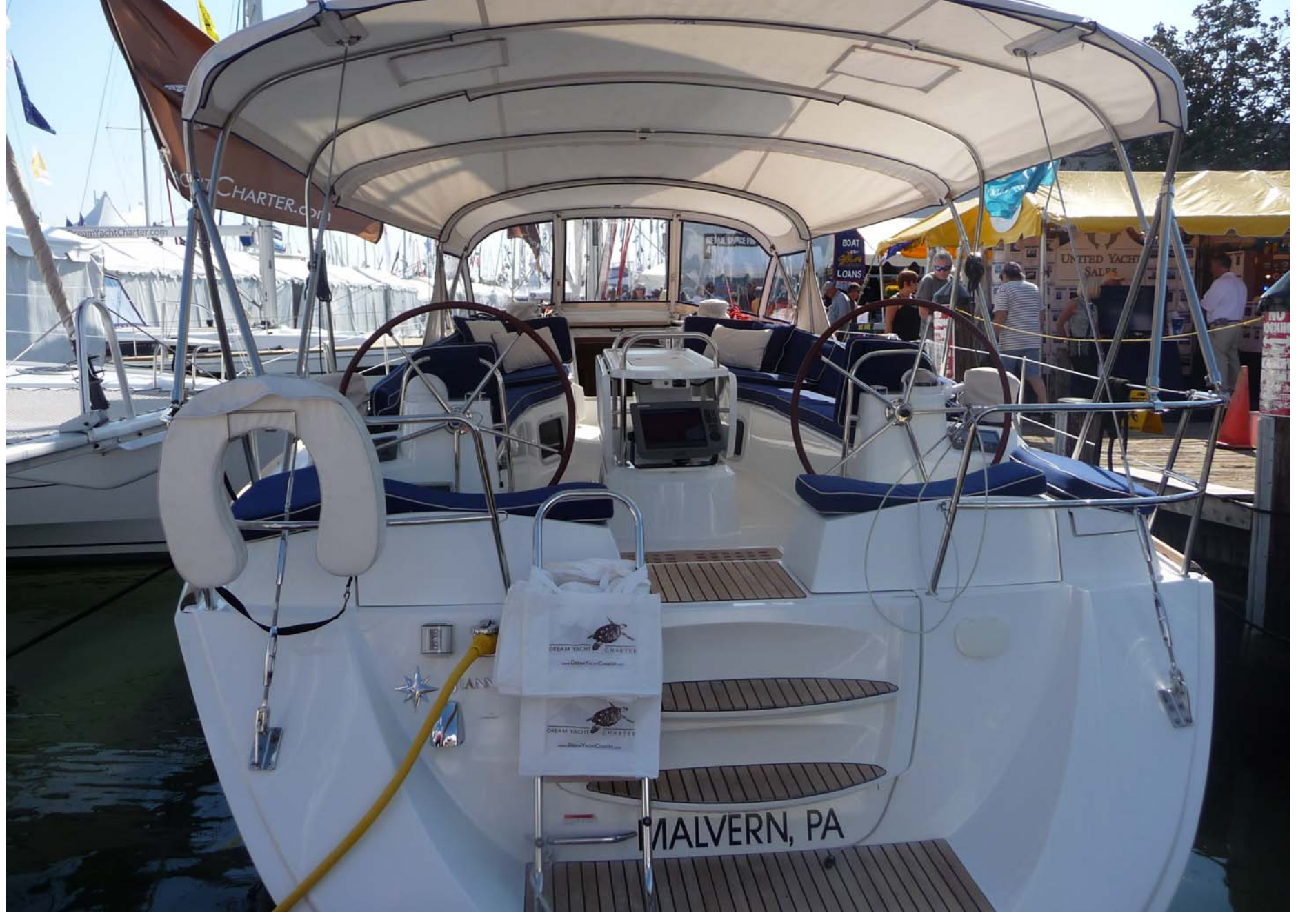
A Jeanneau sailboat at the Boat Show.