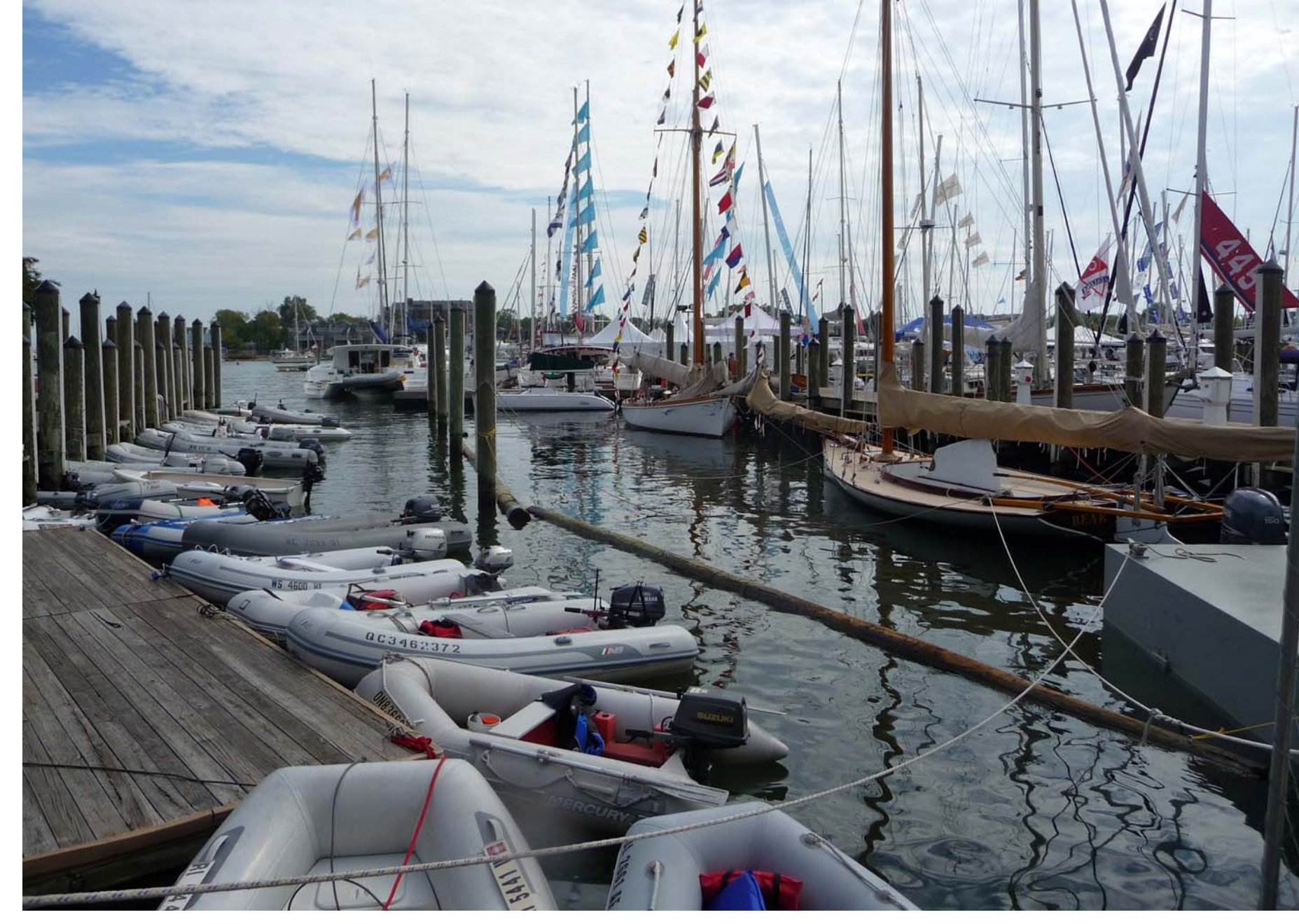
Annapolis dinghy dock and some classic boats.