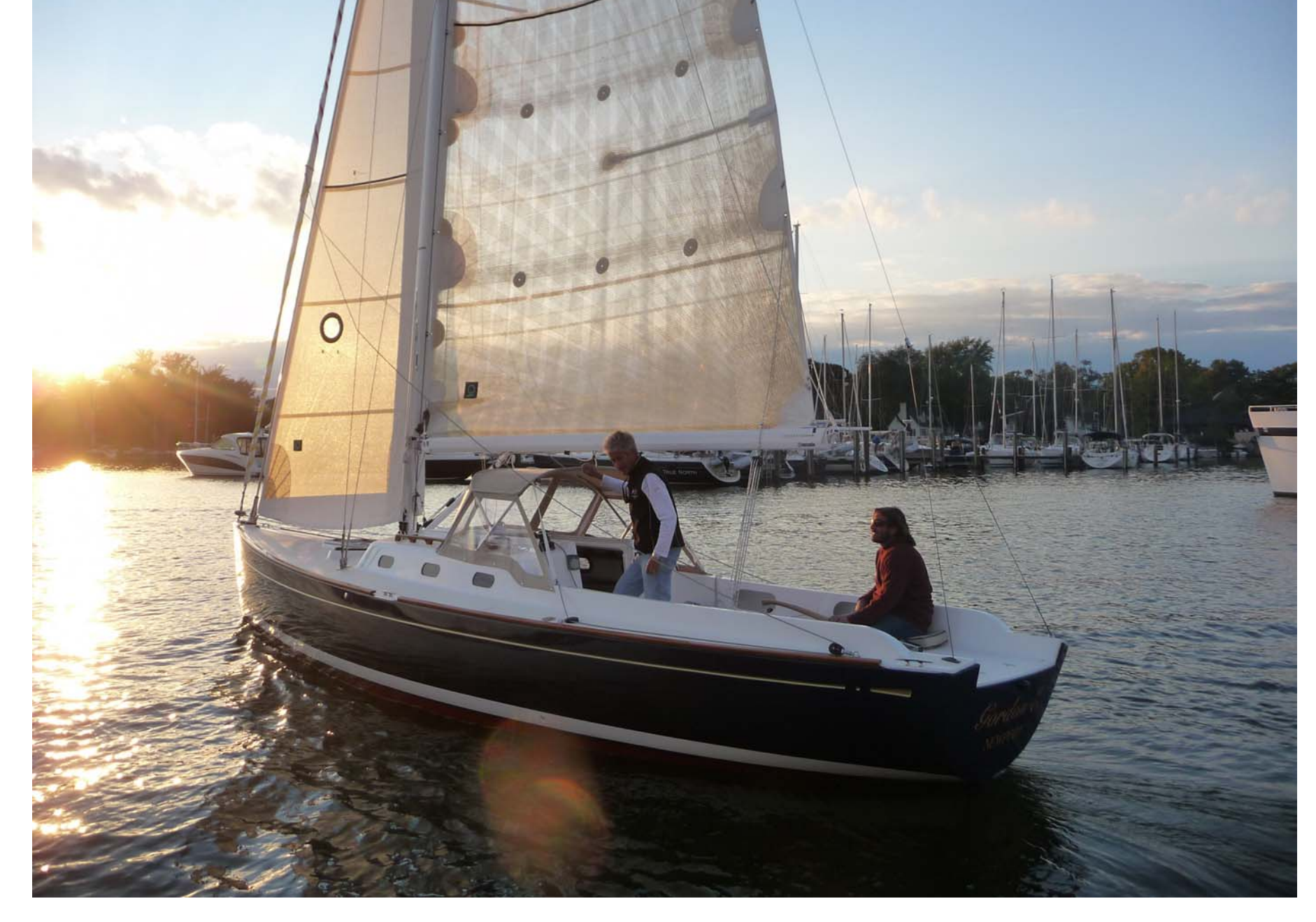
Hull #1 of this Sparkman Steven's 30. So pretty.