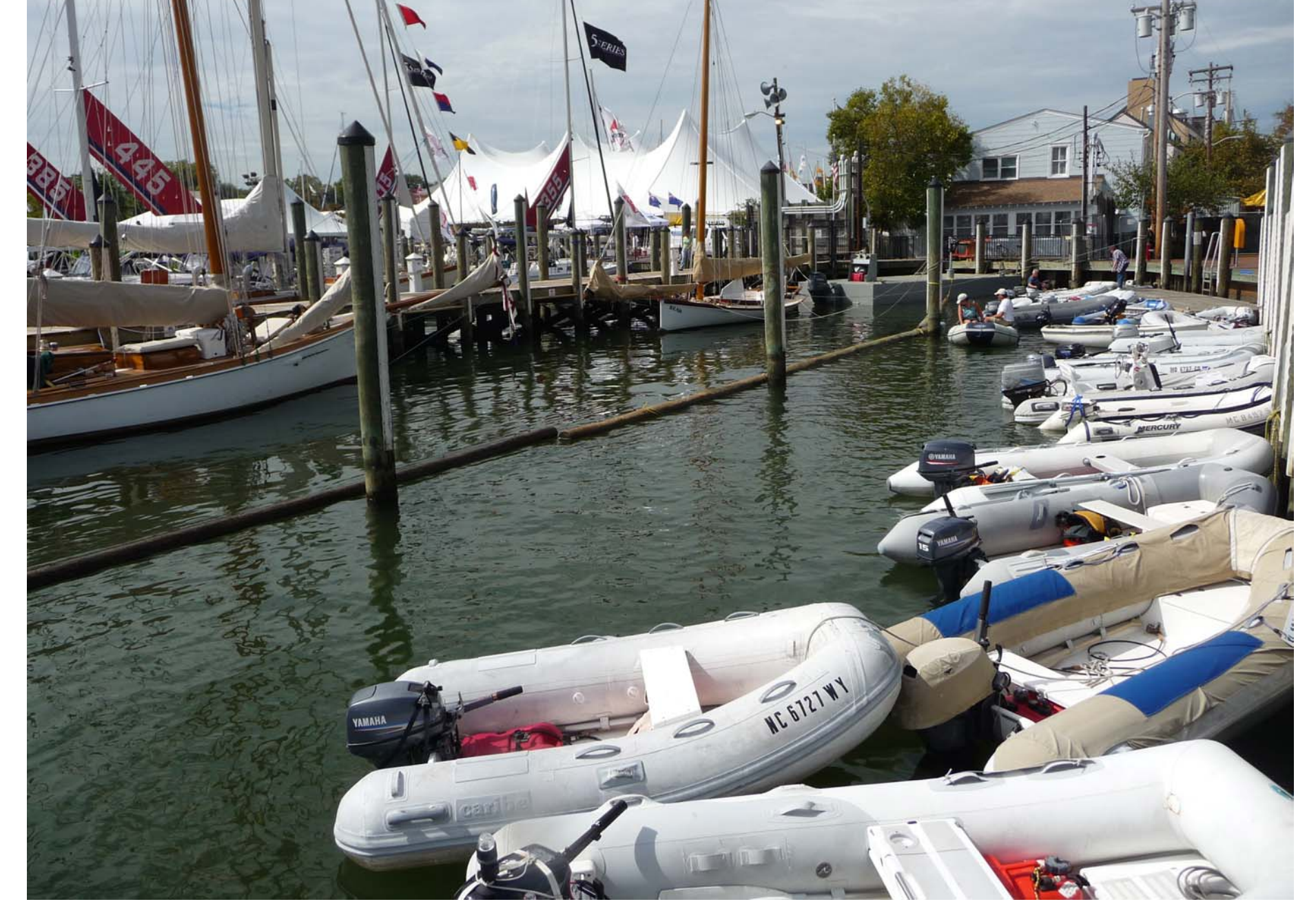
The only free parking at the Annapolis Boat Show, the dinghy dock.