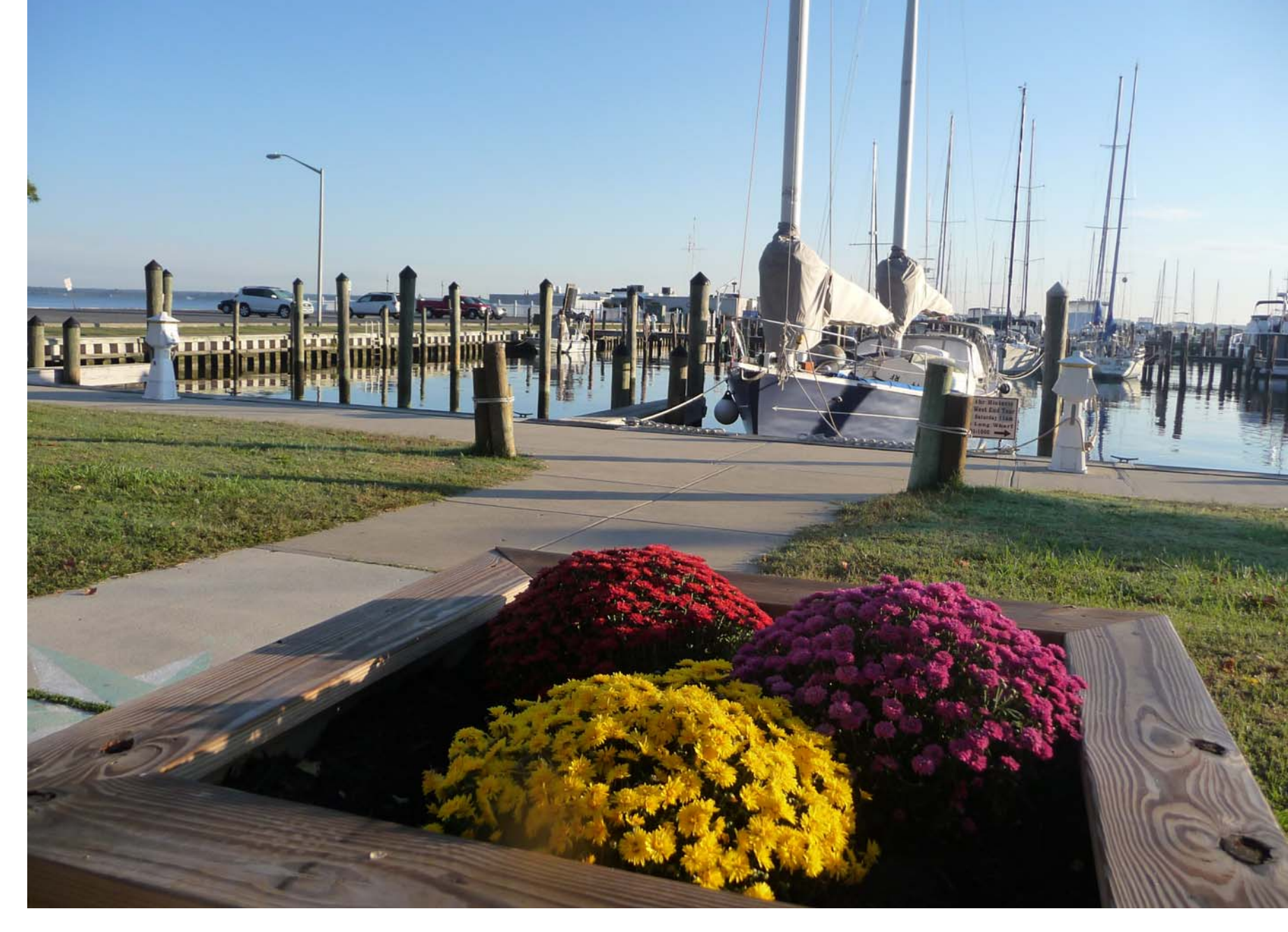
At the Cambridge Municipal Marina.