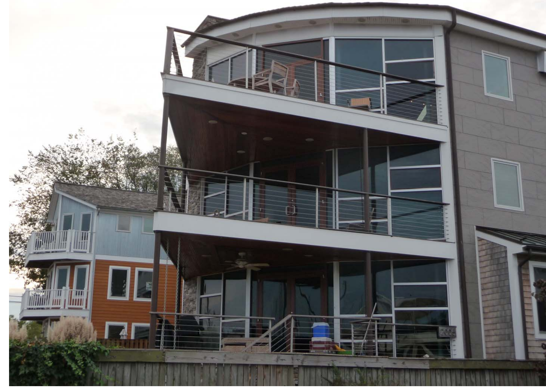
Interesting apartment building by the dinghy dock in Eastport, a unique Annapolis neighborhood